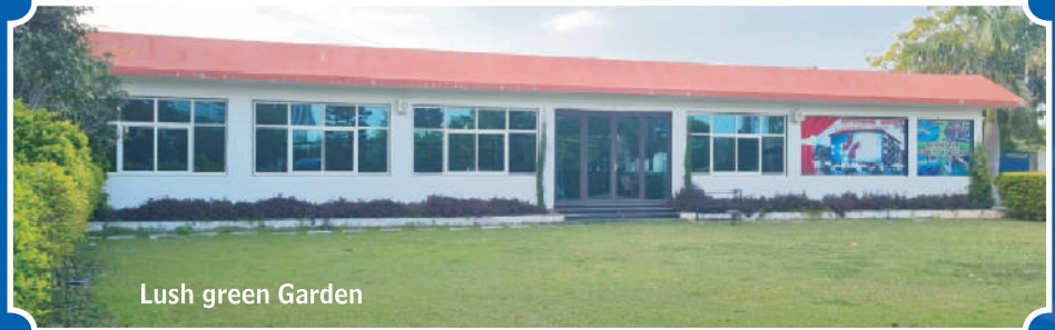
Lush green Garden